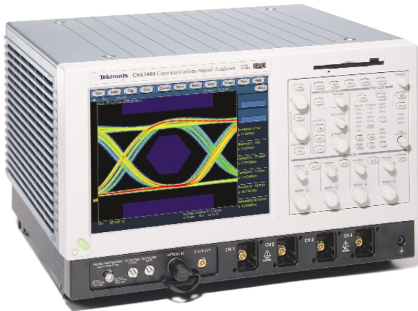
► The CSA7004 Communications Signal Analyzer performs mask testing and signal analysis for optical and electrical communications signals at rates up to OC-48 /STM-16; 2.5 Gbps.