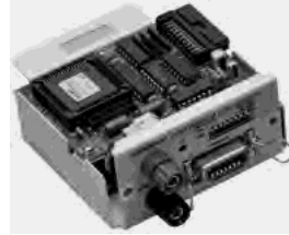
R13223 Printer I/F & Analog Output Unit