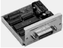
R13220 GPIB Interface Unit