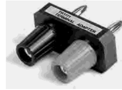
TR1111 Terminal Adaptor