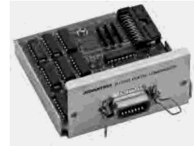
R13016 Digital Comparator Unit