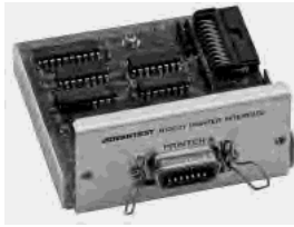
R13221 Printer Interface Unit