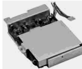
R15807 Battery Unit