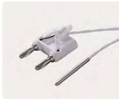
E2308A Thermistor Probe