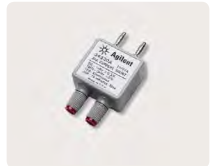
34330A 30A Current Shunt