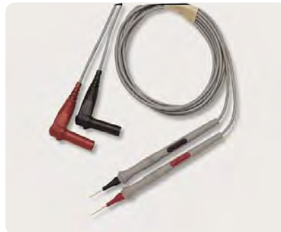
34133A Precision Electronics Test Leads