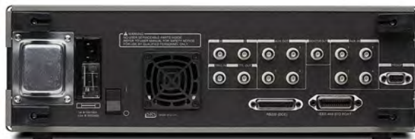
SR810/830 rear panel