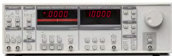
SR810 DSP Single Phase Lock-In Amplifier