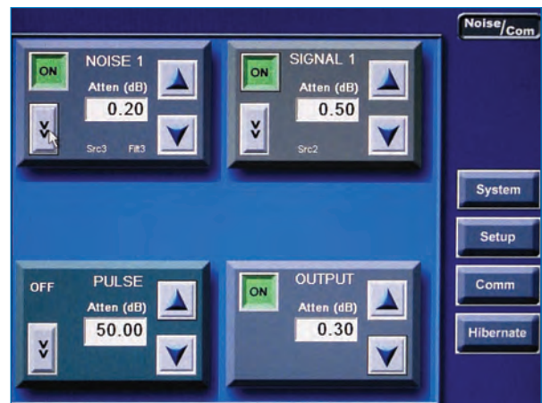
Intuitive standard control menu