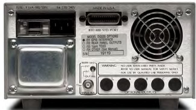
DG535 rear panel (with Opt. 02)